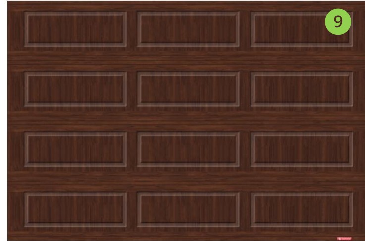
9. GARAGE DOOR American Walnut Standard + Shaker Flat XL.