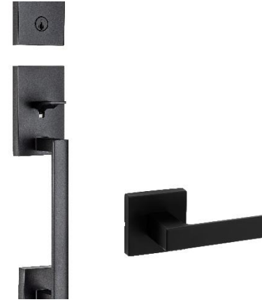
8. DOOR HARDWARE San Clement Handleset With Singapore lever in Matte black.