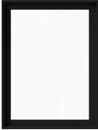
6. WINDOWS Black vinyl No Grills Modern windows.